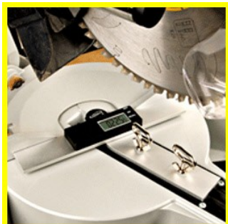
DIGITAL MITER SAW GAUGE